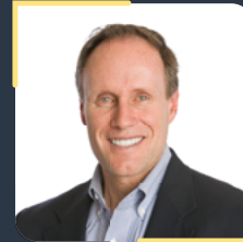
Stephen M.R. Covey

Groundbreaking leader and former CEO at AT&T Business