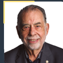
Francis Ford Coppola

Leading happiness and well-being researcher at the University of British Columbia