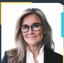
Angela Ahrendts DBE

Tech expert, serial startup investor and founding Editor-in-Chief of WIRED UK